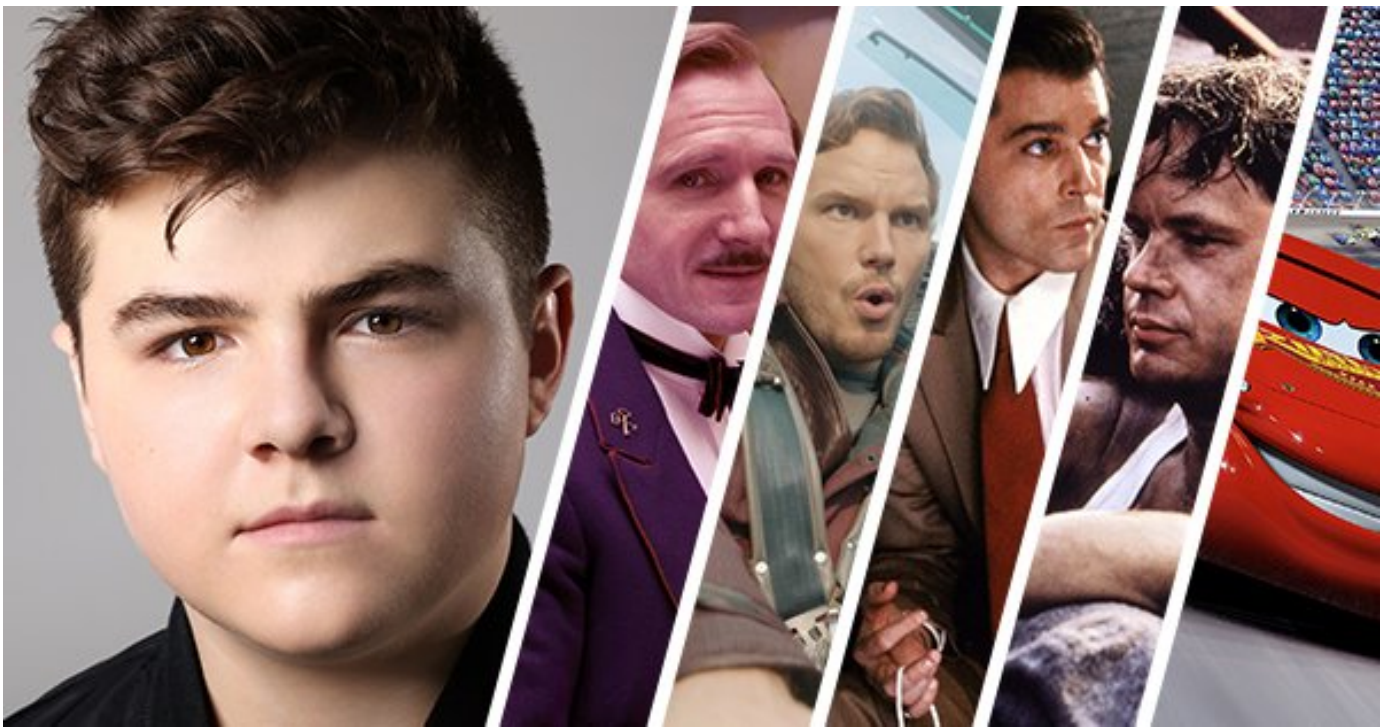
William Ludwig's Five Favorite Films September 30, 2021