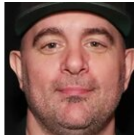
We Finally Know The Truth About The Chopped Judges Mashed.com