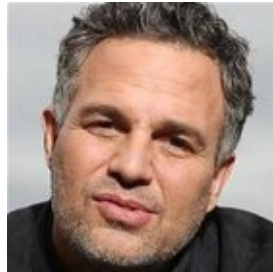
The Tragedy Of Mark Ruffalo Just Gets Sadder And Sadder Looper.com