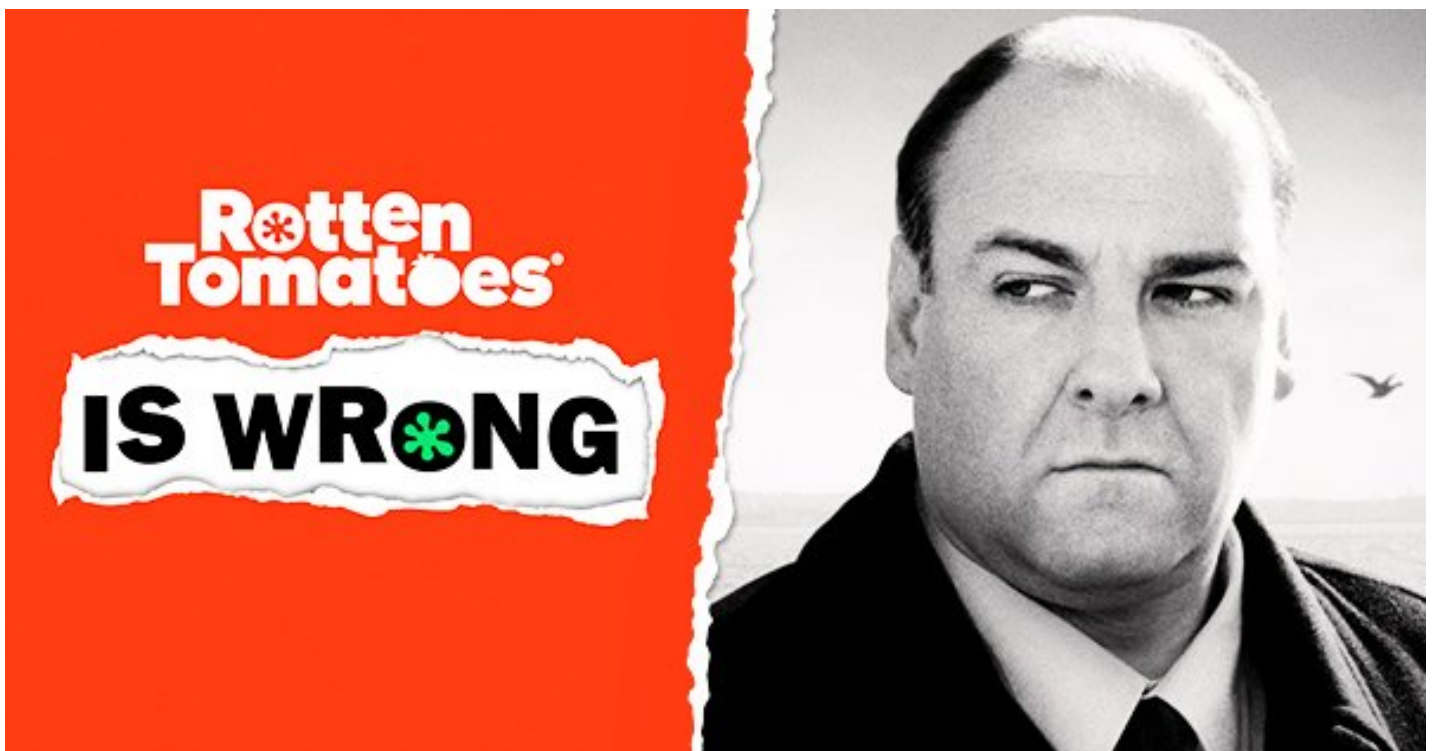
"Rotten Tomatoes Is Wrong" About... The Sopranos