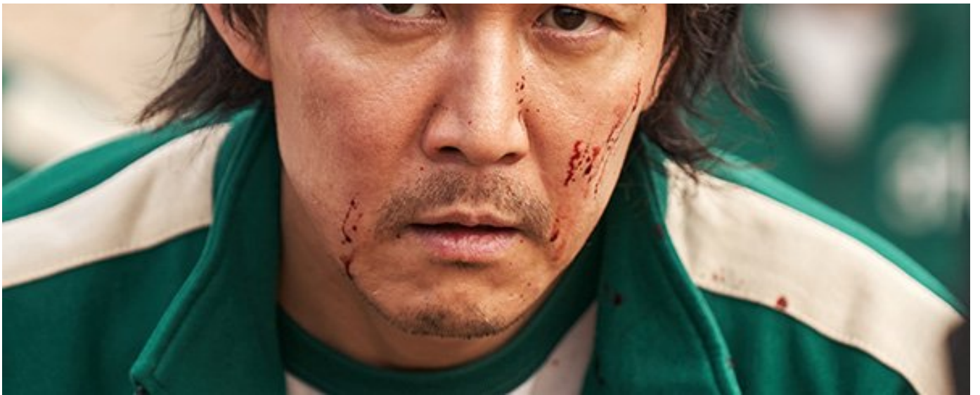
Love Squid Game ? Here Are 10 TV Shows and Movies Just Like It September 30, 2021